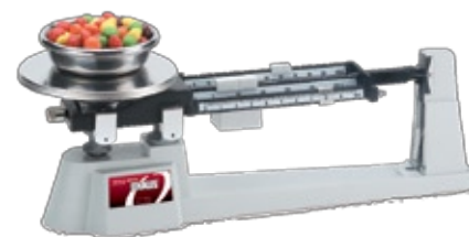
Triple Beam 750-S0