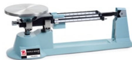
Triple Beam junior TJ611